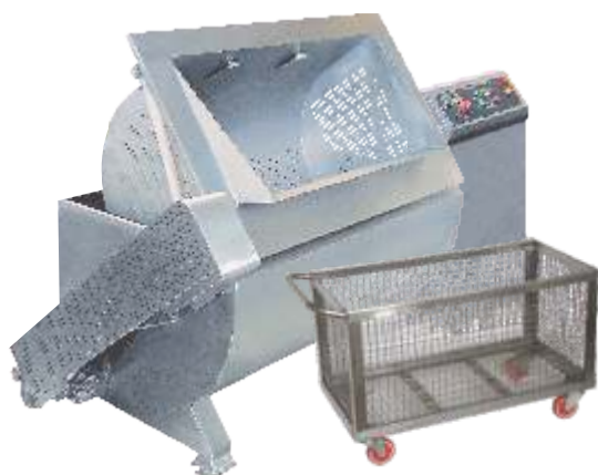
Model CVW - 30