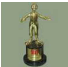
Best Supplier Award, 2002 by McDonalds