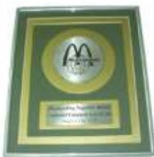
Best Supplier Award, 2004 by McDonalds