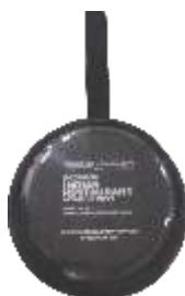
Best Kitchen Equipment Supplier, 2011