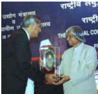
National Awards to Small Scale Entrepreneurs 2003

Continental also boasts of the largest network of service in the country with service centers in 14 different cities.